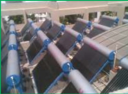
SOLAR WATER HEATING SYSTEM