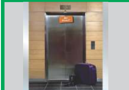
CONSUL LIFT OPERATING SYSTEMS