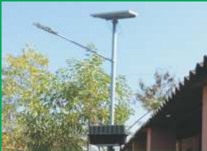
SOLAR FENCING / STREET LIGHT