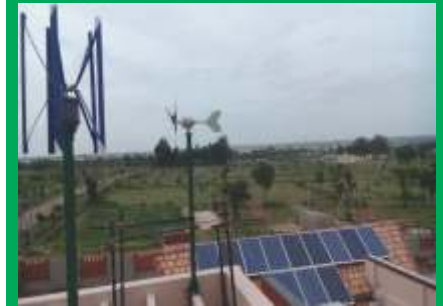
VERTICAL / HORIZONTAL - WIND MILL