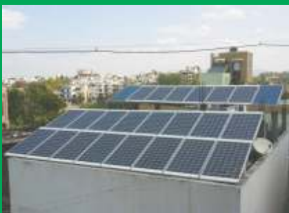
SOLAR PHOTO VOLTAIC SYSTEM