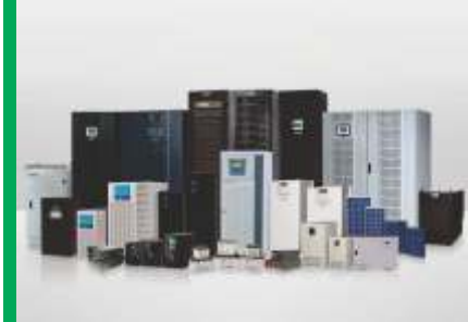
NUMERIC ONLINE UPS