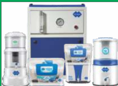
BLUE MOUNT WATER PURIFIERS