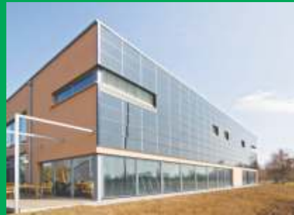
SOLAR GLASS FACADE INTEGRATION