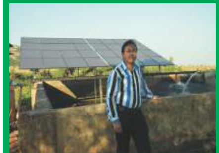
SOLAR WATER PUMPING SYSTEM