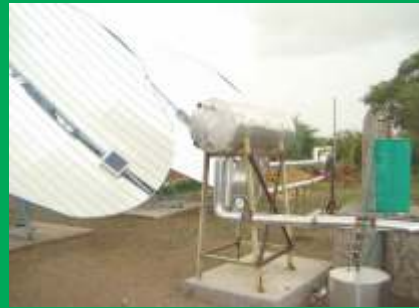
SOLAR COOKING - SCHEFFLER COOKER