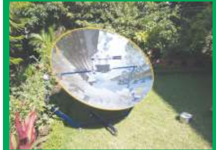
SOLAR PARABOLIC COOKER SK-14