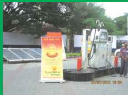
SOLAR PETROL PUMP